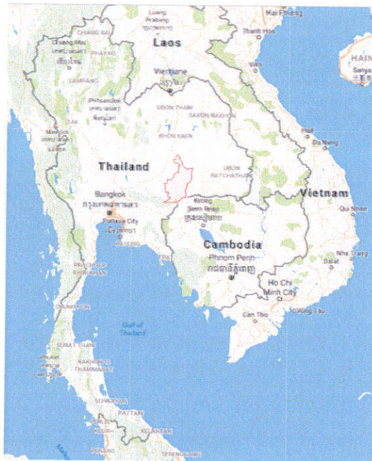
Buriram province shown in red

I visit Thailand during the summer holidays and stay with my grandmother and grandfather. They live on a farm in a village in Buriram which is one of the north eastern provinces of Thailand.